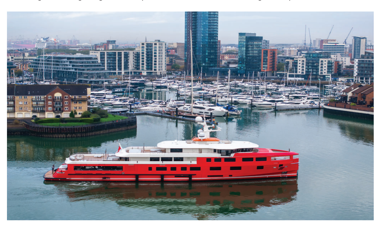
Founded in 1963, Walcon Marine is the market leader in the design, construction and installation of marinas, yacht harbours and berthing facilities around the world. As probably the longest established and most experienced company in its field, Walcon Marine is a global organisation with manufacturing facilities in the UK, Australia and Dubai. Its pontoons are now installed in over 30 different countries on five continents.

With its new layout and facilities, Ocean Village today offers 326 berths for yachts up to 90 metres in length, and has set a new benchmark in UK marina design and specification.