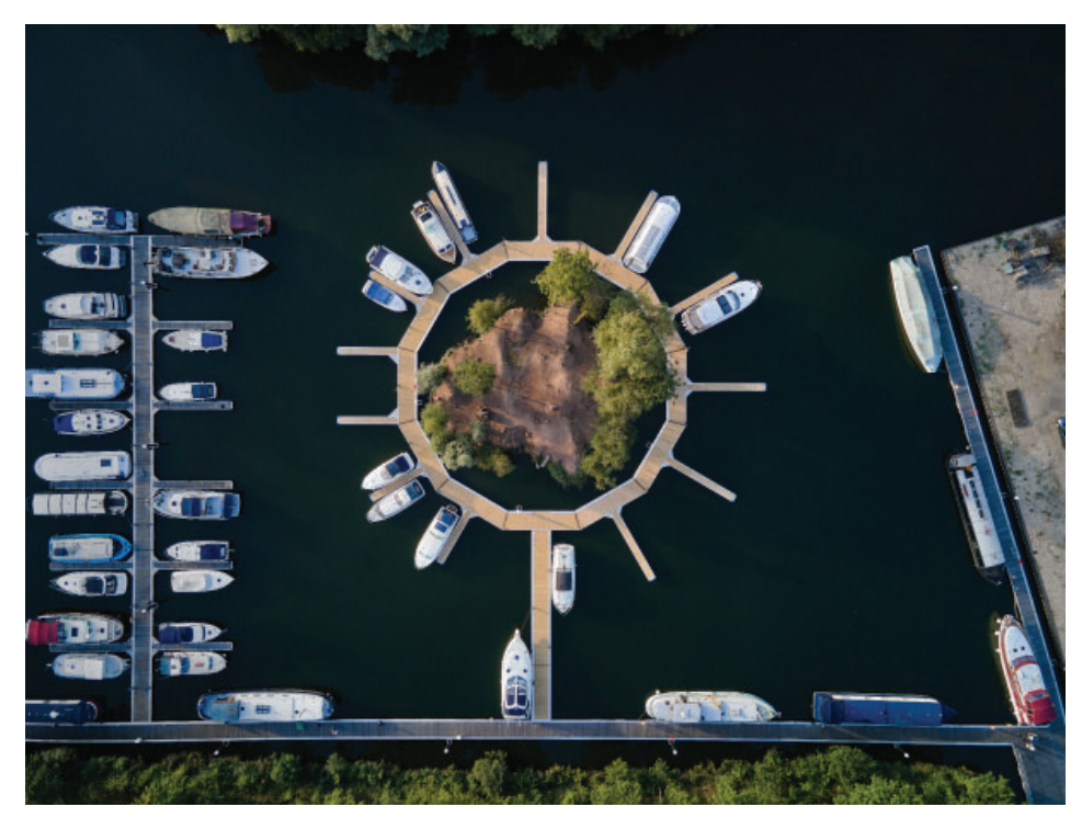
Founded in 1963, Walcon Marine is the market leader in the design, construction and installation of marinas, yacht harbours and berthing facilities around the world. As probably the longest established and most experienced company in its field, Walcon Marine is a global organisation with manufacturing facilities in the UK and Australia. Its pontoons are now installed in over 30 different countries on five continents.