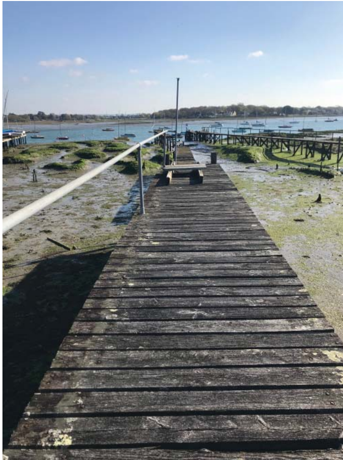
Above: how it looked before replacement. Below: the Walcon team at work installing the new jetty