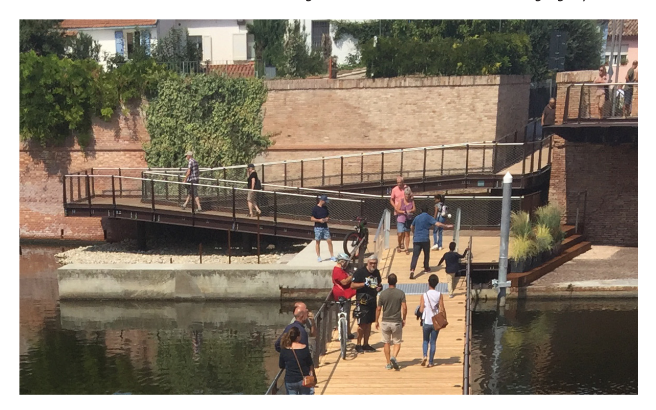
The close-up image below shows one of the wheelchair and stroller-friendly ramps down to the water level where the bridge is then accessed via an articulated gangway

Founded in 1963, Walcon Marine is the market leader in the design, construction and installation of marinas, yacht harbours and berthing facilities for leisure, commercial and official purposes around the world. As probably the longest established and most experienced company in its field, Walcon Marine is a global organisation with manufacturing facilities in the UK, Australia and Dubai. Today its pontoons can be found installed in over 30 different countries on five continents.