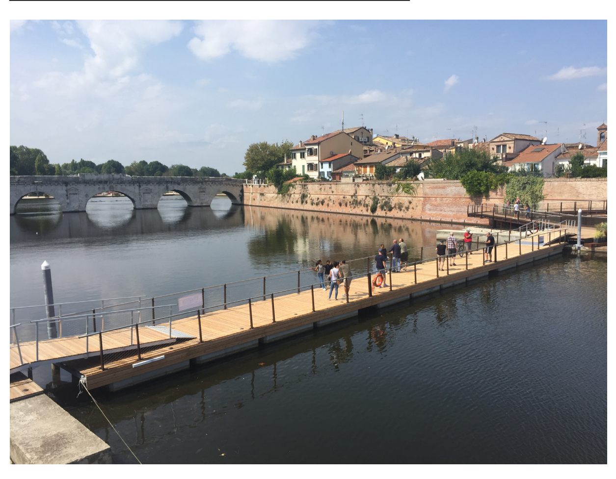
The new bridge in the foreground with the ancient Ponte de Tiberio behind

In 2019, Walcon Marine Italia completed a sensitive installation in the heart of the historic Italian city of Rimini, involving the design and build of a floating bridge linking the two banks of the ancient Canal de Ponente.