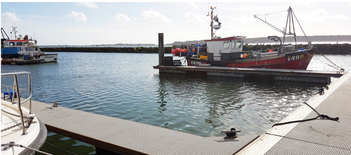
Image left shows the GRP mesh that Walcon recommends for its non-slip properties, easiness to clean and minimal maintenance requirements.

Founded in 1963, Walcon Marine is the market leader in the design, construction and installation of marinas, yacht harbours and berthing facilities around the world. As probably the longest established and most experienced company in its field, Walcon Marine is a global organisation with manufacturing facilities in the UK, Australia and Dubai. Its pontoons are now installed in over 30 different countries on five continents.