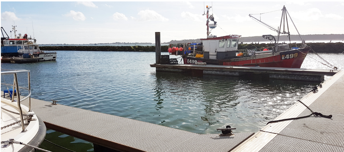
Image left shows the GRP mesh that Walcon recommends for its non-slip properties, easiness to clean and minimal maintenance requirements.

Founded in 1963, Walcon Marine is the market leader in the design, construction and installation of marinas, yacht harbours and berthing facilities around the world. As probably the longest established and most experienced company in its field, Walcon Marine is a global organisation with manufacturing facilities in the UK, Australia and Dubai. Its pontoons are now installed in over 30 different countries on five continents.