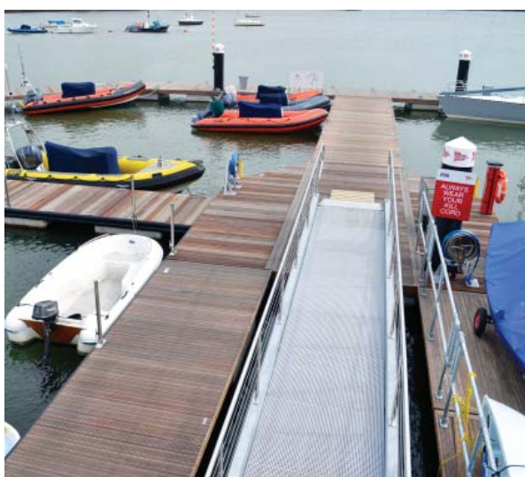
View of the walkway and pontoons from the balcony

There is also a 100 m 2 platform for the storage of the dinghies used in the Club's Wednesday Junior Sailing community programme. The outer pontoon provides 45 metres of berthing for deeper draft yachts. Additional features include low level LED lighting, Wi-Fi and security cameras.