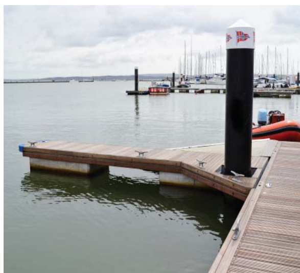
Robust and safe construction

Founded in 1963, Walcon Marine is the market leader in the design, construction and installation of marinas, yacht harbours and berthing facilities around the world. As probably the longest established and most experienced company in its field, Walcon Marine is a global organisation with manufacturing facilities in the UK, Australia and Dubai. Its pontoons are now installed in over 30 different countries on five continents, and recent projects include the marina built at Portland on the south coast for England for the 2012 Olympics.