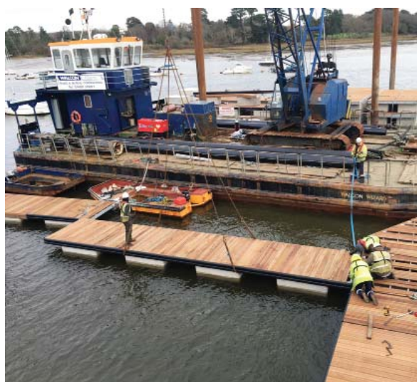
The Walcon Wizard delivers the new pontoons