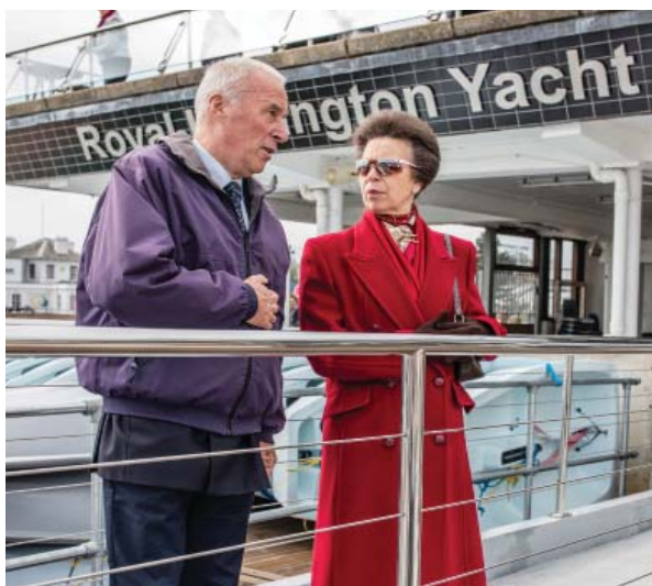
The Princess Royal

To maximise the berthing space and minimise the risk of damage to yachts and dinghies through inadvertent collision, the pontoons were designed to fit around the steel piles.