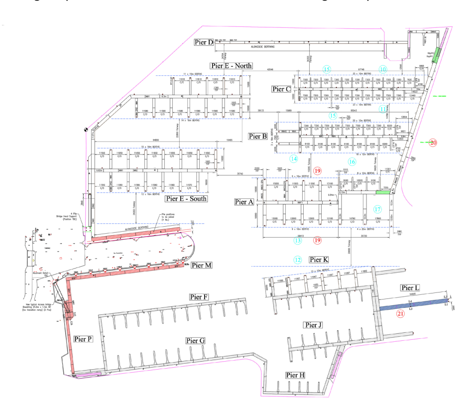
Founded in 1963, Walcon Marine is the market leader in the design, construction and installation of marinas, yachtharbours and berthing facilities around the world. As probably the longest established and most experienced company in its field, Walcon Marine is a global organisation with manufacturing facilities in the UK, Australia and Dubai. Its pontoons are now installed in over 30 different countries on five continents, and recent projects include the marina built at Portland on the south coast for England for the 2012 Olympics.

With its new layout and facilities, Ocean Village now offers 326 berths for yachts up to 90 metres in length, and has set a new benchmark in UK marina design and provision.